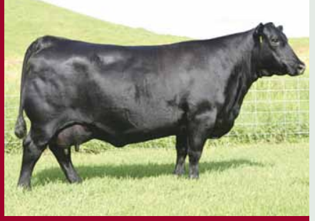
DAM: S A V ELBA 801