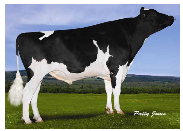
Gen-I-Beg Lavaman. No.1 UK PLI proven sire