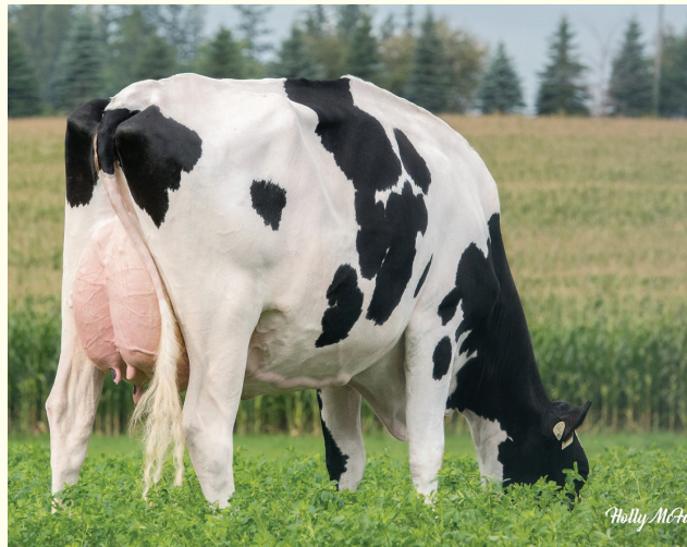
GLEN ISLAY CINDERDOOR STARLING VG-87-2YR-CAN

RIGHT -LEFT: GLEN ISLAY CINDERDOOR STARLING VG-87-2YR-CAN GLEN ISLAY CINDERDOOR FROST NC GLEN ISLAY CINDERDOOR RUMMY NC GLEN ISLAY CINDERDOOR BOMBA NC FIELDHOLME CINDERDOOR COOCHIE NC GLEN ISLAY CINDERDOOR BRYNN VG-85-2YR-CAN