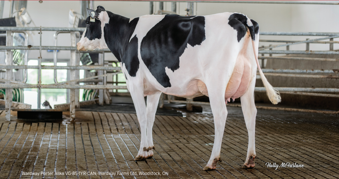
Wardway Porter Alika VG-85-1YR-CAN, Wardway Farms Ltd, Woodstock, ON