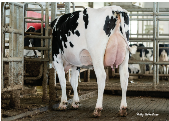
Vriesdale Porter Lonely GP-84-2YR-CAN, Vriesdale Holsteins, Mountain, ON