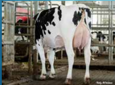
Vriesdale Porter Lonely VG-85-2YR-CAN, Vriesdale Holsteins, Mountain, ON