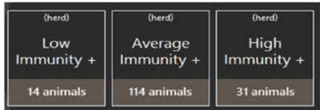
Chart 3: Mating groupings based on Immunity Female Status in OptiMate

Next, Elevate loads all genomic data including Immune Female results directly into the OptiMate™ mating program. As seen above, OptiMate™ seamlessly sorts animals based on immune status and matches them to the herd’s breeding goals.