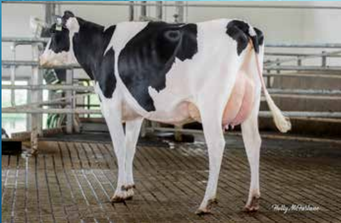
Wardway Porter Alika VG-85-1YR-CAN, Wardway Farms Ltd, Woodstock, ON