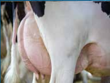
Germec Liasse Porter VG-85-2YR-CAN, Ferme Germec, Inc, Herouville, QC