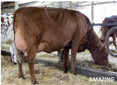
La Croisee Amazing Flicka n/c

Another strong proof round for our Ayrshire breeders with the addition of one new proven sire and one new Genomax™ sire to our growing Ayrshire line-up. Des Coteaux AMAZING debuts as the new #2 Pro$ sire with $1654 Pro$, #2 GLPI sire with an amazing +3200 GLPI, and #6 Milk, #3