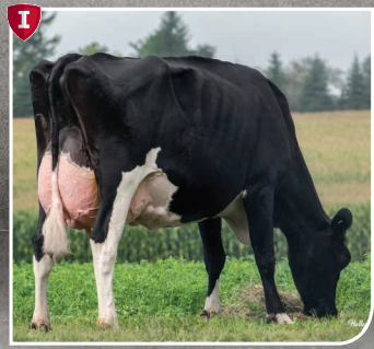
Glen Islay Unix Frozen EX-91-2E-CAN