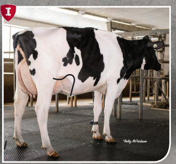
Athlone Adagio Moncton GP-84-2YR-CAN