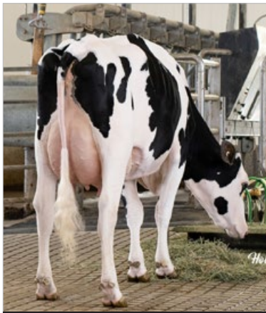
Wardway Fuel Belladonna VG-85-2YR

Despite the relentless challenges our industry has had to face in 2020, we can all take pride knowing that our resolve and focus has been rewarded with one of the most impressive proof rounds ever experienced in Canada.