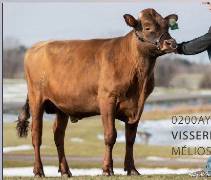
0200AY01114 VISSERDALE SELIOS MÉLIOS x YRITE

Westcoast Background *RC - 3622 GPA LPI, $2923 Pro$, +12 CONF. Ranger-Red x Ashby x VG-88 5* McCutchen x VG-87 Explode x EX-92 Goldwyn x 8 gen VG or EX dams. Background is an early Red Carrier Ranger-Red son from a family filled with high scoring, high lifetime production cows. Breeders can expect solid production with high deviations (+.56% Fat, +.22% Protein), a type profile that will tick all of the boxes, and outstanding Immunity (111 Immunity, 111 Calf Immunity). Vogue Palgrave PP - 2992 GPA LPI, $1284 Pro$, +10 CONF. A2P2-PP x EX x Calbrett Kingboy Miranda P EX-93 6* ('21 HI Impact Cow of the Yr., '22 HI Polled Cow of the Yr.). A homozygous polled A2P2 from the one of the hottest families in reality in the world. With Palgrave PP, who is a A2A2 and Robot Ready® designated, you can expect high deviation milk (+.39% Fat, +.16% Protein), pleasing Conformation (+10), & polled calves!