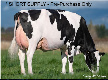
Dam: Mystique Lambda Anis VG-89-4YR-CAN

Ranger-Red x VG-89 Lambda x EX-94-3E 5* x EX-93-2E-USA 3* x VG-88 13* x EX-90-2E 12* x 8 more generations of VG or EX dams