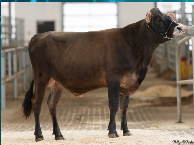
0200JE01492 Lencrest Artemis