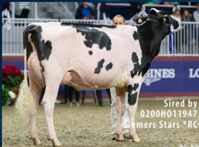
Dau.: Blondin Stars Alice VG-87-2Y