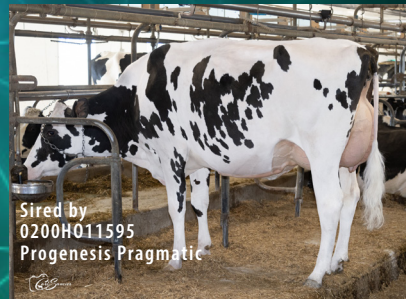
Dau.: Montmagny Pragmatic Safala VG-2Y

The first dairy proof round of the year has arrived and you can be confident that EastGen's expansive sire line-up will offer the very best genetic solutions available anywhere for your herd.