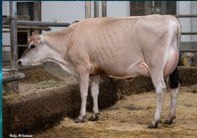
Tobefamous Dau.: Claessic Fields Tobefamous Hazel VG-85-2YR-CAN

Three new Ayrshire additions this proof round starting with the #7 ranked GPA LPI sire Tilecroft Siesta . By Bournstar, Siesta is from the maternal line that was pivotal to Tilecroft Ayrshires of Osgoode, Ontario earning their Master Breeder shield in 2024. His dam is a VG-87 ELITE Arbiter from a VG-87 ELITE Yellow from a VG-86 1* Revolution, all three have exceptional production records. Siesta delivers on his production potential with +1244 Milk (#5 in Canada), +50 Fat (#8), +44 Protein (#5) while ranking #7 for both National scales (+3129 GPA LPI, $1389 Pro$). He is also +7 for Conformation. Joining Siesta will be the newly proven Des Coteaux Armageddon (Pretzel x Revolution x Rockstar). Armageddon is from a high producing branch of the "Happy Spirit" family. He debuts with +3126 GLPI (#6), $1569 Pro$ (#2), +641 Milk, +68 Fat (+.50%), +37 Protein (+.18%) and +5 Conformation.