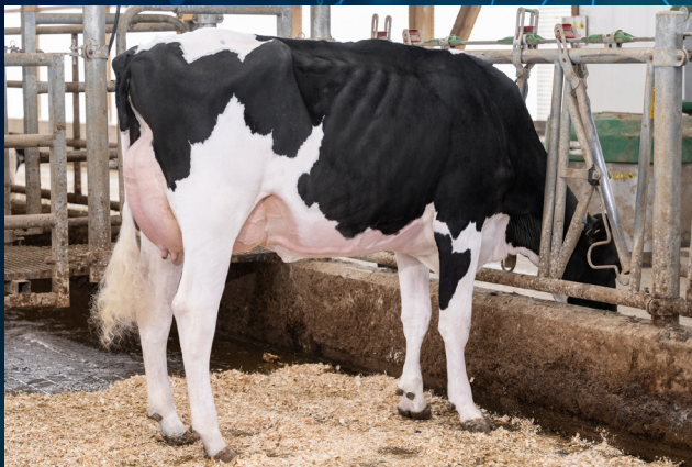
Claynook Mayfair Daughter: Comrie Mayfair Uramada N/C

We start the year out right with a series of exciting new sires ideally suited for every dairy segment. Regardless of your herd goals, we have sires that will offer you outstanding value.