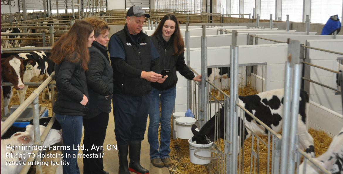
Perrinridge Farms Ltd., Ayr, ON Milking 70 Holsteins in a freestall/ robotic milking facility