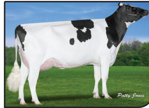
CLAYNOOK FABBY SILVER VG-87-2YR-CAN 02-01 305 11557M 491F 4.3% 393P 3.4%