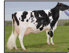
VIEUXSAULE ALLEN DRAGONFLY EX-94-2E-CAN 05-05 305 13814M 553F 4.0% 432P 3.1%