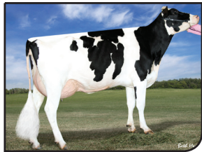
REGAN-ALH PLANET DELORIA VG-86-2YR-USA 02-04 305 13336M 590F 4.4% 476 3.6%