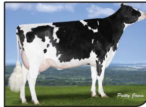
PROGENESIS ENFORCER PAT GP-82-3YR-CAN 02-03 305 13999M 536F 3.8% 492P 3.5%