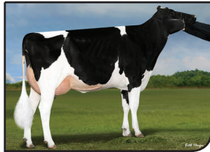
WELCOME YODER CALLO GP-82-2YR-USA