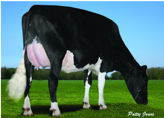
BARVEL LONGTIME ABBIE