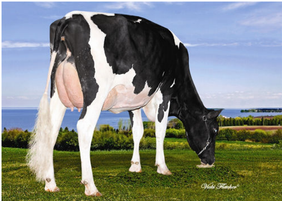
RAYNALYNE MURDOCK MODULACE