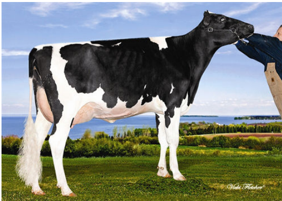
RAYNALYNE MURDOCK MODULACE