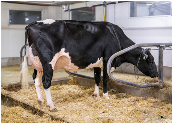
DUBENOIT MONTEVERDI EVELY DAUGHTER