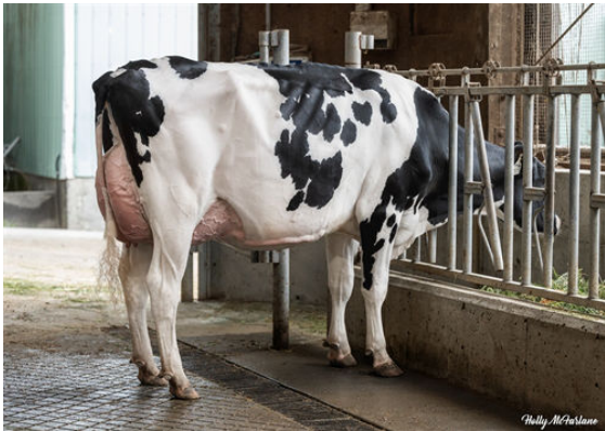
WESTCOAST MNTVRDI ABYSS 14595 DAUGHTER