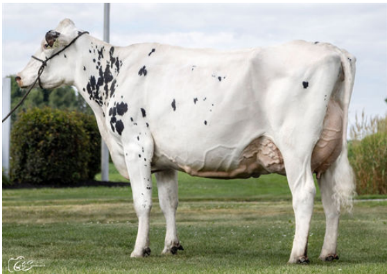
CLEAR-ECHO MONTVRDI 5621 DAUGHTER