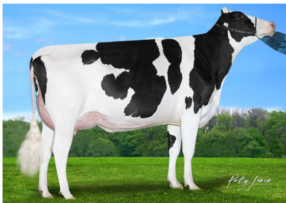
CLAYNOOK CHRIS RENEGADE DAM