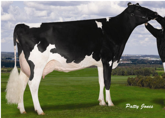
PETITLAC HORELIE LHEROS FIFTH DAM