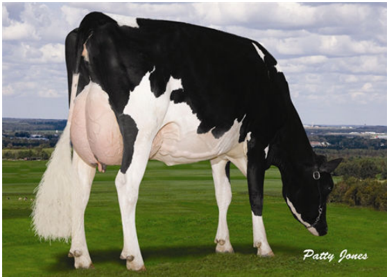
PETITLAC HORELIE LHEROS FIFTH DAM