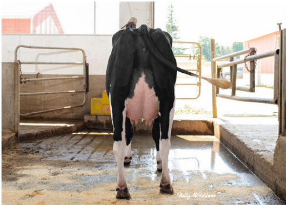
PROGENESIS CHARLEY TULIP FIFTH DAM