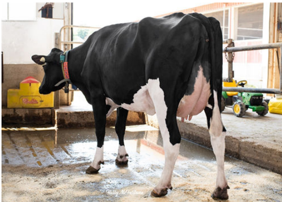
PROGENESIS CHARLEY TULIP FIFTH DAM