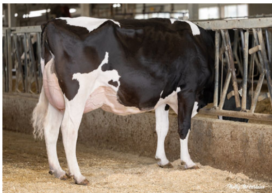
PROGENESIS GAMEDAY SIGNAL GRANDDAM