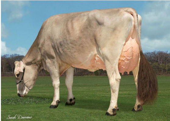
HILLTOP ACRES S NUTELLA DAM