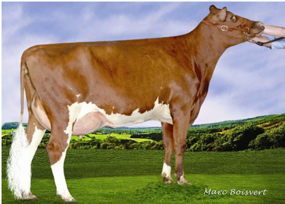
LAROC OBLIQUE FANIE FIFTH DAM