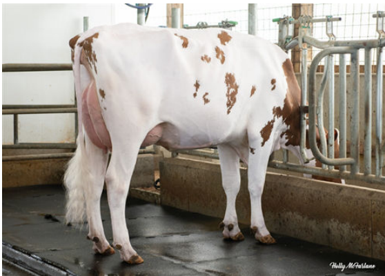
NORTH-POLLED RANGER MIRACLE P DAUGHTER