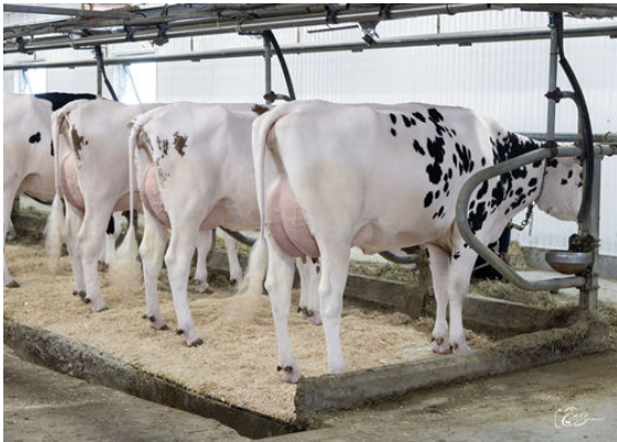
RANGER DAUGHTER GROUP DAUGHTER