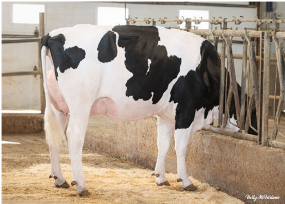
PROGENESIS RANGER ANTHEM DAUGHTER