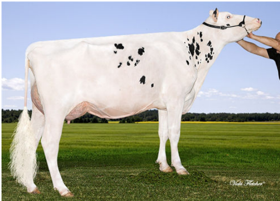
SILVERRIDGE V MOGUL EVON DAM