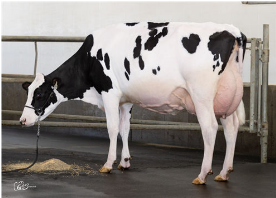
VERTDOR ALLIGATOR MIKA DAUGHTER