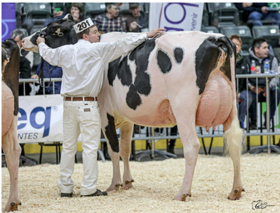
MODO ALLIGATOR LILO DAUGHTER