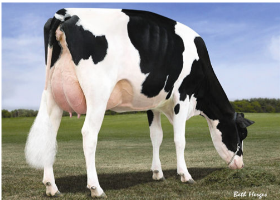
MORSAN MAN D MISSY THIRD DAM