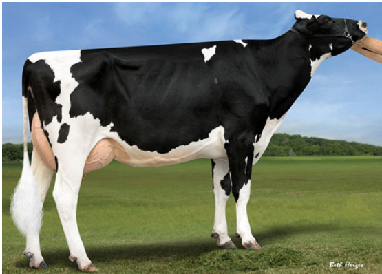
FAIRMONT DELTA RHONDA DAM