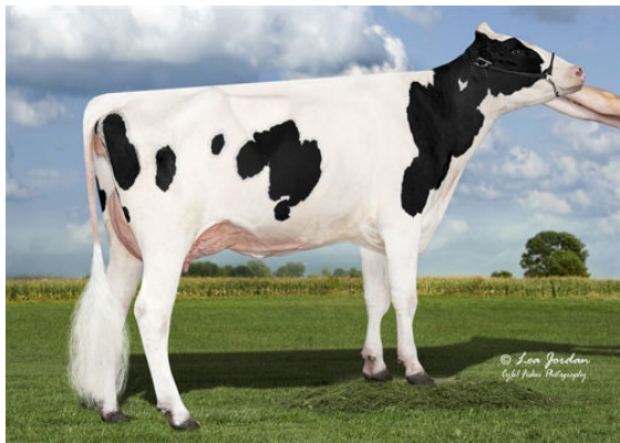
SCENERY-VIEW CRYSTAL DAM