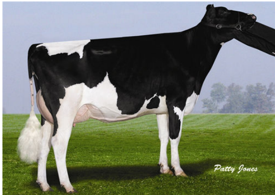
WHITTIER-FARMS HE REBECA FIFTH DAM