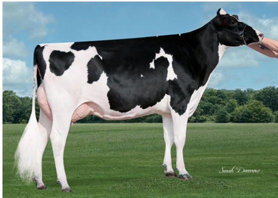
SIEMERS DOORMAN ROZ THIRD DAM