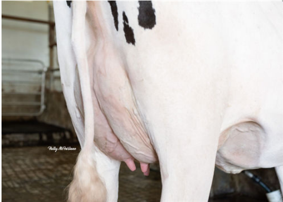
FB LULU ACHV VEGAS DAM