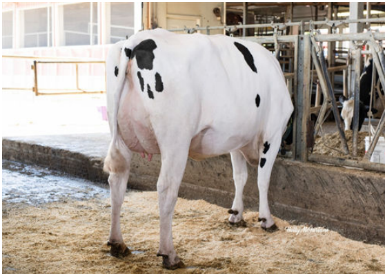
FB LULU ACHV VEGAS DAM