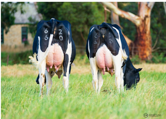
ROCKNROLL DAUGHTER GROUP L TO R - ROCKWELLA FARM ROCKNROLL DIXIE, ROCKWELLA FARM ROCKNROLL DEANNE