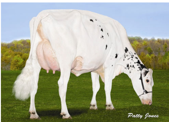
VELTHUIS SG SNOW EVENT FIFTH DAM