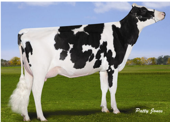
GEN-I-BEQ SNOWMAN SUMMER FIFTH DAM