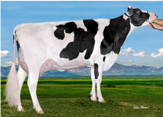
MS SOFIAS DELTA SKY THIRD DAM