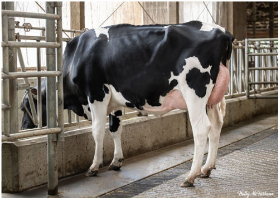
PROGENESIS ACTIONMAN AMIDALA DAUGHTER