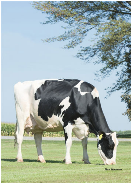
KINGS-RANSOM MG CLEAVAGE GRANDDAM