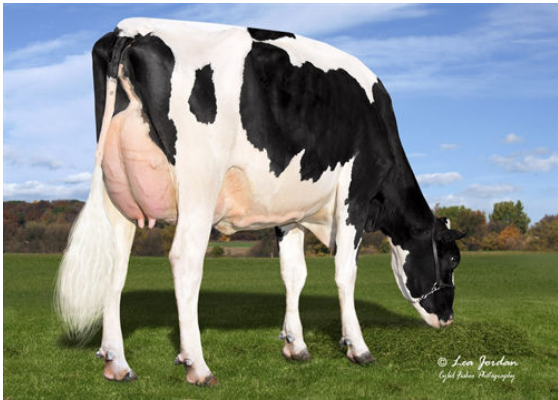
KINGS-RANSOM KD CARNIVAL DAM