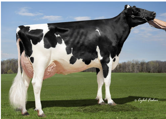
KINGS-RANSOM DELTA DESTINY GRANDDAM