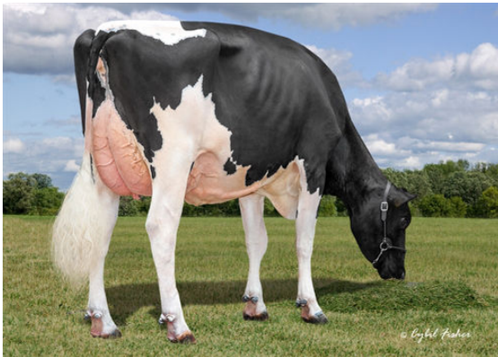
KINGS-RANSOM CASP DAZE DAM