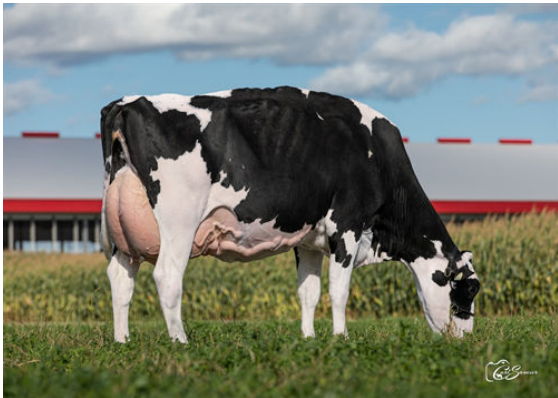
COMESTAR LAMAGIC IMPRESSION DAM