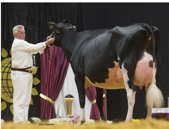
COMESTAR LAMADONA DOORMAN GRANDDAM