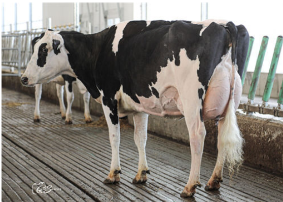
COMESTAR LAMAGIC IMPRESSION DAM