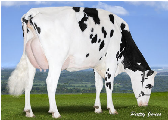
PEAK BOMBERO MAXIMA FOURTH DAM