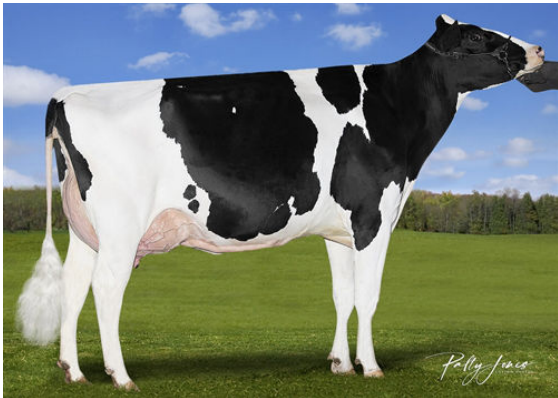
VOGUE YODA SALLY-PP DAM