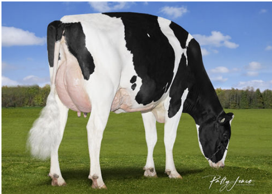
VOGUE YODA SALLY-PP DAM