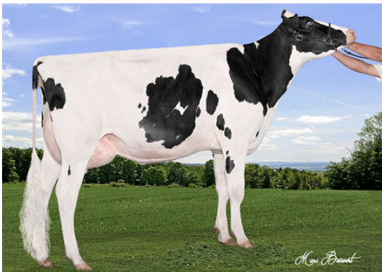
JOSEY-LLC UNO SANGARIA THIRD DAM