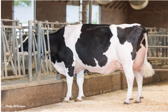
MYSTIQUE LAMBDA ANIS DAM