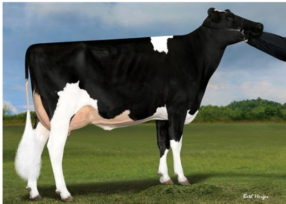
IHG LOTTOMAX TANIA FIFTH DAM