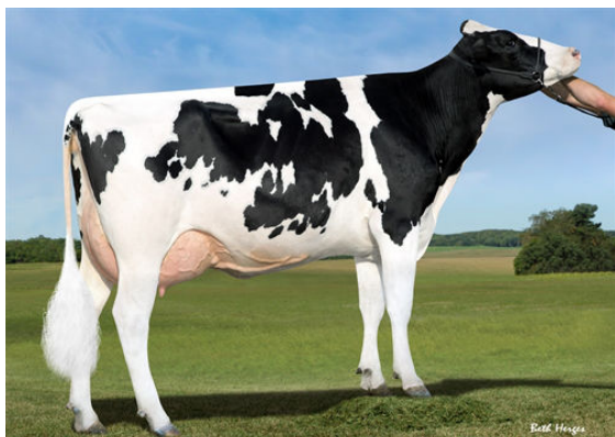
SANDY-VALLEY MORGAN ERA FOURTH DAM