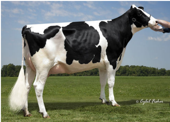
EDG RUBY UNO RAE 2054 FIFTH DAM