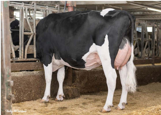
DREWHOLME CONWAY SPARE TIME P DAM