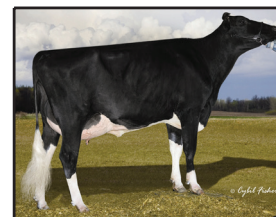
IHG JACEY GRACE-ET VG-85-2YR-CAN 02-01 ACT 11168M 473F 4.2% 391P 3.5%