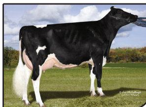
COOKIECUTTER MOM HALO-ET VG-88-2YR-USA 02-00 305 14093M 729F 5.2% 510P 3.6%