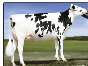
MS C-HAVEN OMAN KOOL VG-88-6YR-CAN 05-05 305 17684M 557F 3.2% 571P 3.2%