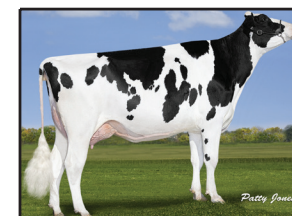
SNOWBIZ MCCUTCHEN LOTTIE VG-87-2YR-CAN 02-02 305 10854M 416F 3.8% 345P 3.2%