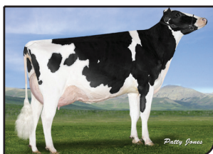
EDG RUBY UNO RIZA VG-87-2YR-CAN 02-03 305 12636M 459F 3.6% 400P 3.2%