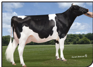
EVER-GREEN-VIEW EANO GP-83-3YR-USA