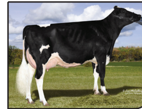
COOKIECUTTER MOM HALO VG-88-2YR-USA 02-00 305 14093M 729F 5.2% 510P 3.6%