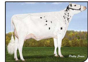
VELTHUIS SG SNOW EVENT VG-86-3YR-CAN 03-00 305 15398M 534F 3.5% 483P 3.1%