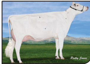
BLUE-HORIZON JCKMN BABYDUST VG-87-3YR-CAN 02-07 P151 13916M 620F 4.5% 475P 3.4%