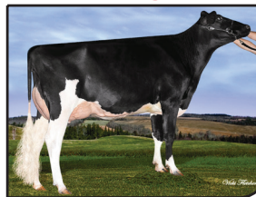
LINDENRIGHT BRADNICK MOOVIN ON VG-87-2YR-CAN 02-00 305 11887M 596F 5.0% 381P 3.2%