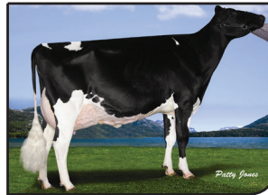
MS CHASSITY GOLDWYN CASH EX-91-CAN 02-04 305 15406M 652F 4.2% 500P 3.3%