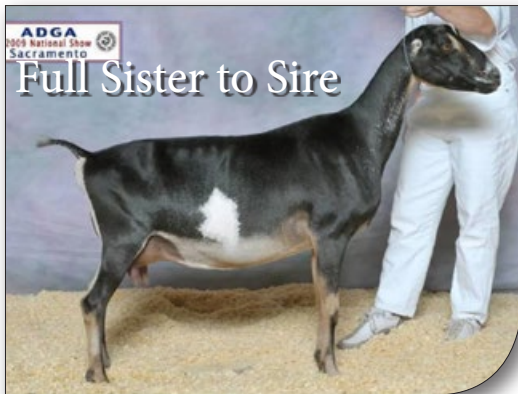
Full Sister to Sire