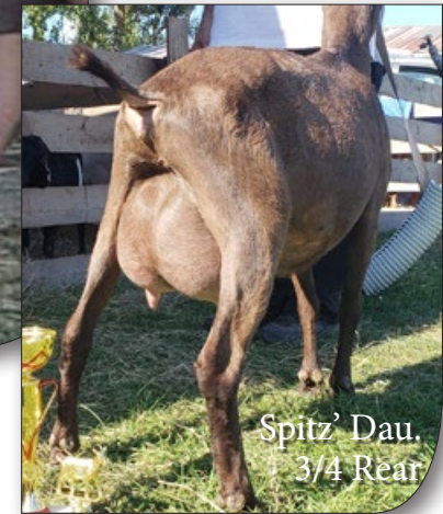
Spitz' Dau. 3/4 Rear