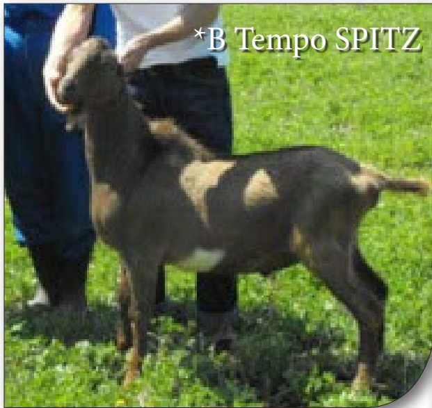
*B Tempo SPITZ