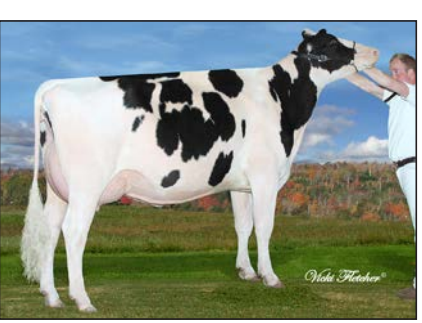
Pictured: Glennholme Belles Beauty EX-91-2E

The whole package! This embryo is sired by the exciting Numero Uno from Goldwyn Anushka, a production powerhouse (2 Super 3's, 4 Superior Lactations)!