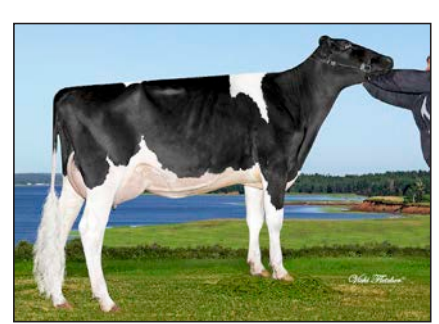
Pictured: Mapel Wood Libby Sanchez VG-86-2YR