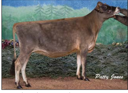
Pictured: Lookout Res Baby Boom VG-86-2YR

An exciting pedigree! Libby's second dam is the famous Lila Z.