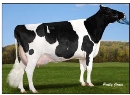
Pictured: BVK Dundee Delores-ET EX-90

Murrayholm Outside Lil was Jr. Champion Stormont 2004!