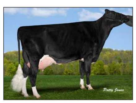
Pictured: Velthuis Alexander Allie VG-85-2YR

This Stanleycup sired embryo has an extremely deep pedigree with 7 generations of VG or EX with 89*.