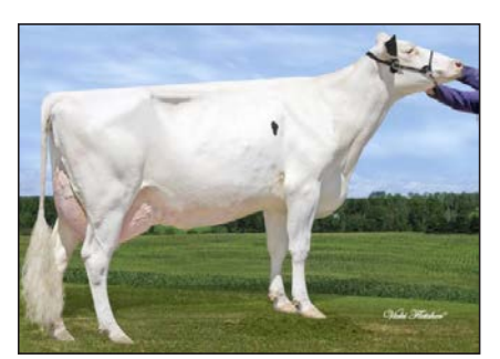
Pictured: Ginary Goldwyn Anushka EX-91-2E

An exciting opportunity to have a Comerica sired embryo out of this fancy Ressurection daughter.