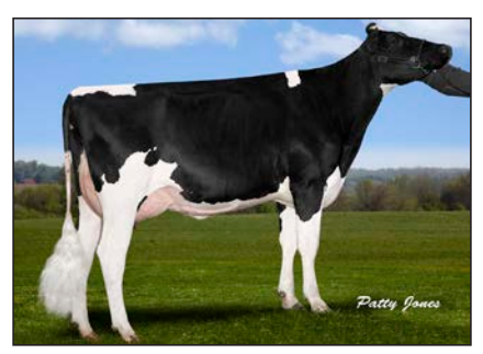
Pictured: Lyba Atwood Autumn Breeze ÝG-86-2YR