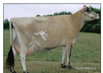
Pictured: Huronia Imp Christie EX-90-3E 3*

Christie is a sister to Huronia Juno Crystalyn, the Dam of Huronia Connectn Crystalyn EX-95-2E (RAWF Grand Champion 2006)