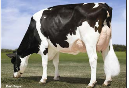
Pictured: Luck-E Advent Asia-ET EX-92-5YR-USA (Dam of Adonis) of Dudoc Mr Burns.

Adonis-Red is a Willsbro Larson son from the pictured Luck-E Advent Asia-ET. Adonis is an exciting cross on Precious, a red and white daughter