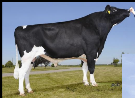
Left is Valleyville Musketeer And below is one of his daughters

He is priced at $32 per dose excl. GST and will be available for spring joining.