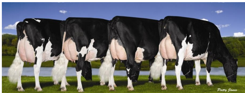
Domicole Chelois daughter group