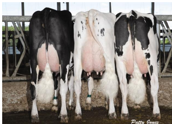
De-Su Authority daughters