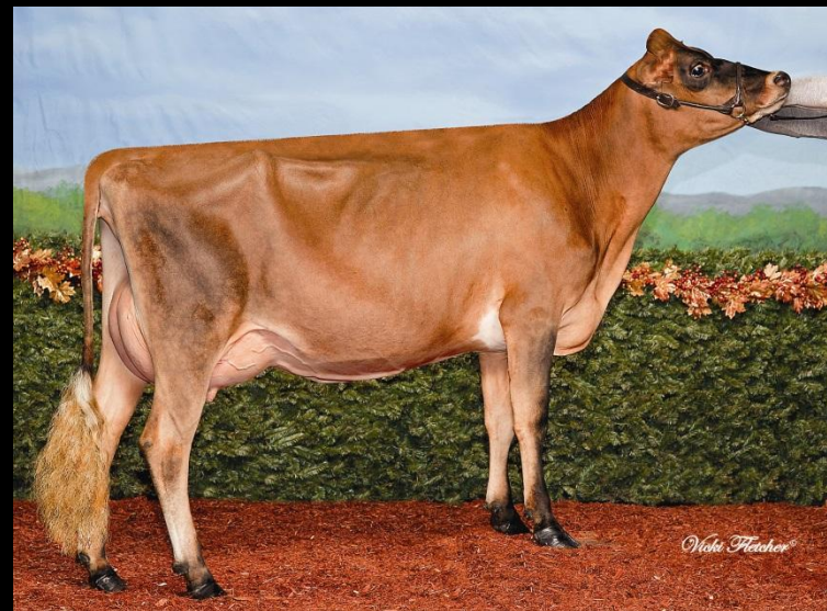
Hometown Money in the Bank