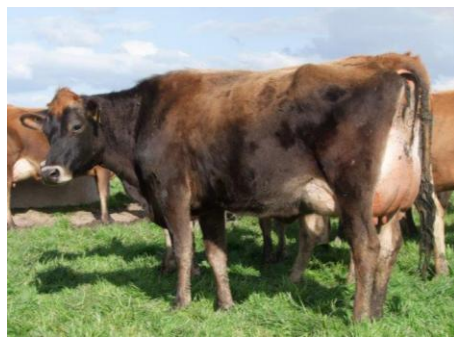
Lencrest Ontime daughters in their 'working clothes'