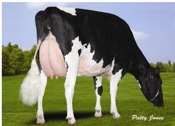
De-Su Authority daughter

He is priced at $32 per dose excl. GST and will be available for spring joining.