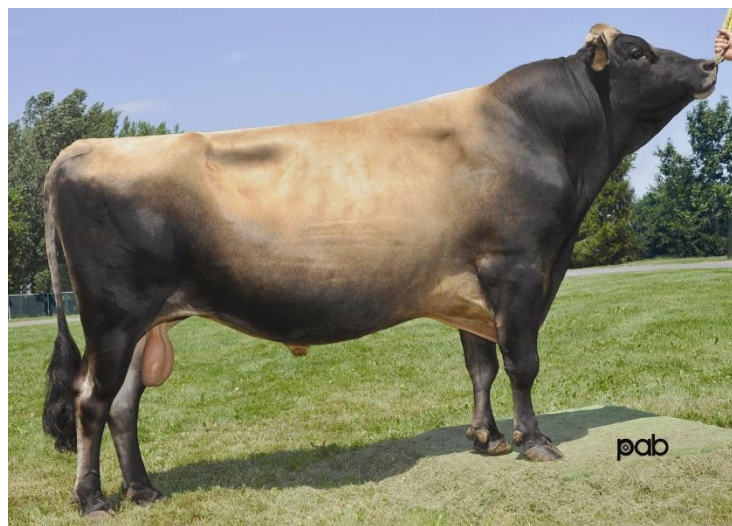
Hometown On The Money

He will be available at $22 per dose (GST exc.) and will be available for spring joining.