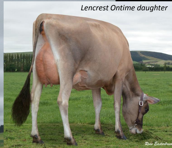
Lencrest Ontime daughter