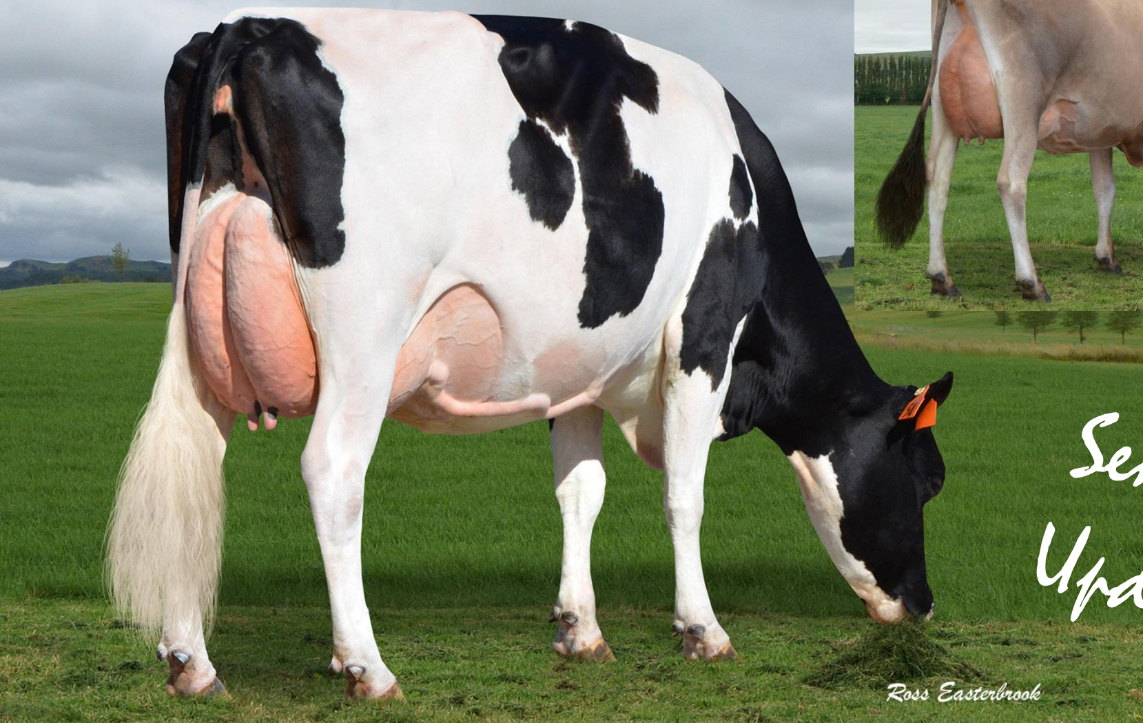
Tahora Taylormade daughter