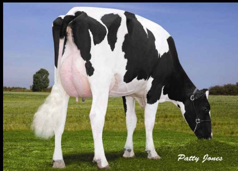
Bluenose Risingstar daughter

Risingstar is priced at $20 per dose excl. GST and will be available for spring joining.